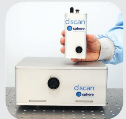
Talk to us for different wavelength range, chirp range, input aperture, and other